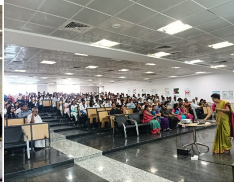
Department of Community Medicine